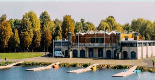
Dorney Lake, Eton

They all represented the school extremely well and thoroughly enjoyed these opportunities.